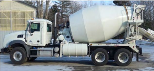
FULL SIDE VIEW - DRIVER