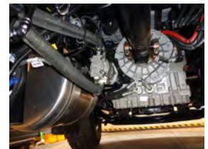
SEND THIS VIEW OF YOUR TRANSMISSION - CHECKING FOR THE PTO/PUMP PATH CLEARANCE