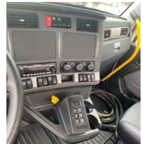
CAB - CONSOLE AREA (2-3)