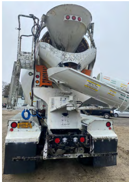
FULL REAR VIEW CHUTE TO SIDE