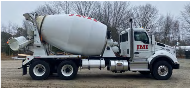
FULL SIDE VIEW - PASSENGER

Mixer truck currently at your location? Please provide a picture set