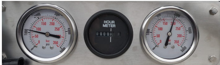
Belt Pressure Hour Meter Pump Pressure